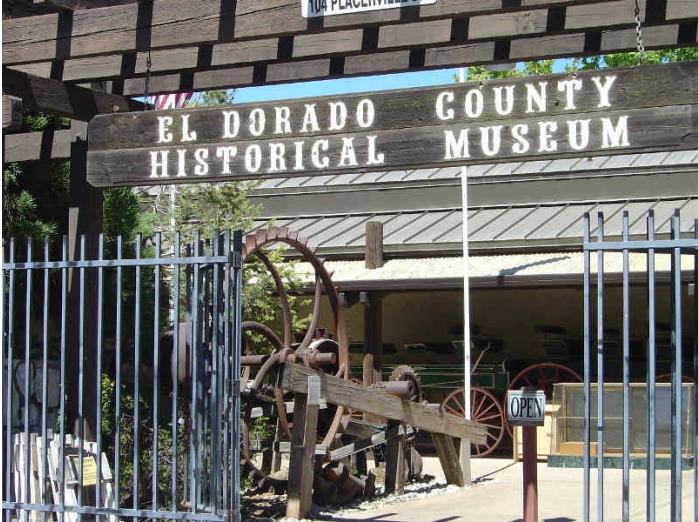
El Dorado County Historical Museum, located next to the El Dorado County Fair Grounds in Placerville.

A MONTHLY PUBLICATION BY THE MOTHER LODGE CHAPTER OF THE SONS OF THE AMERICAN REVOLUTION