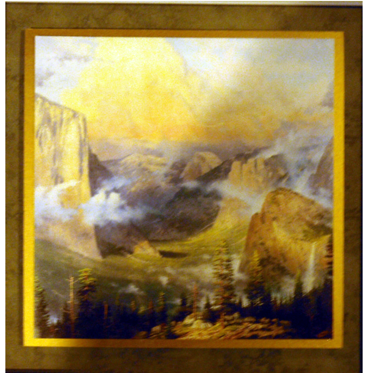
Thomas Kinkade print of the Yosemite Valley, donated by the Thomas Kinkade Gallery in Placerville.

I hope all of the Mother Lode Chapter members will avail themselves of this opportunity to meet the Sacramento members, and join in an afternoon of good fellowship.