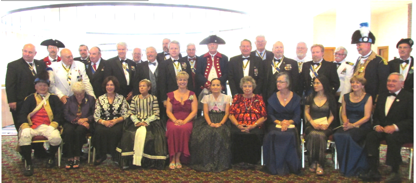
California and Western District members who attended the 2013 National Congress held in Kansas City, Missouri

session of the Congress. The morning session heard the reports by the General Officers and Committee Chairmen. This was followed by the Youth Awards Luncheon where the National Society winners of the Eagle Scout, Knight Essay, Orations, and JROTC contest winners were recognized and received their prizes. The winner of the National Americanism Poster Contest was also named. CASSAR's entry from the Gold Country Chapter came in 2 nd place. After lunch, the business session resumed with more reports, and