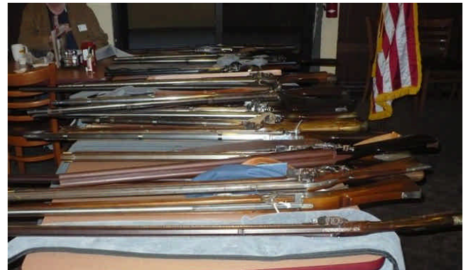
Vince brought a lot of guns!!