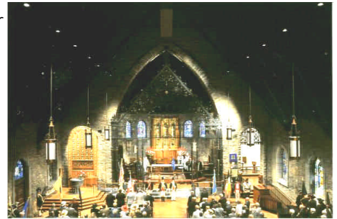
Grace Holy Trinity Cathedral