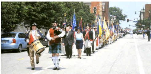
Color Guard marches to the Cathedral.

The real business of the Congress began on Monday. I attended the Council of State Presidents