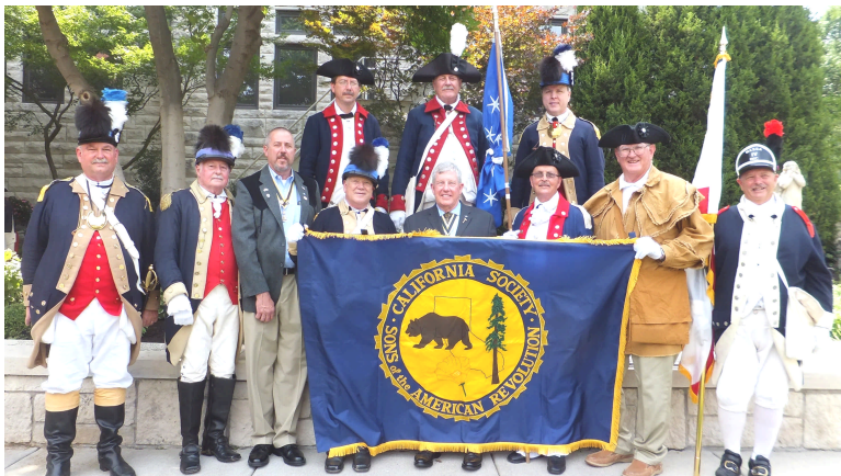
CASSAR members of the Color Guard

Wednesday was the final session of the Congress. The declaration of election of the 2013-2014 General Officers was made followed by the election of the National Trustees. The Congress was adjourned and two optional tours were available for the attendees, a tour of the art museums of Kansas City or a tour to Independence, Missouri, to see the Truman Library, and the National Frontier Trails Museum at the trail head of the Santa Fe, Oregon, Mormon and California Trails. I chose the Independence tour. That evening, the Installation Banquet was held where the newly elected General Officers were sworn-in followed by remarks by President General Joseph W. Dooley. The Color Guard retired the Colors and the Congress was adjourned.