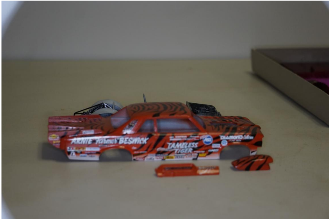
1/320 Revell USS John Paul Jones

I removed all of the built in railings and added 1/350 scale photo etch railings to enhance the kit. There are a lot of mold mark throughout the entire kit. Lots of flash also. Some areas needed to be filled and other sanded down. The original deck assembly is in the foreground. The ship was painted with Tamiya paints. When the final coat of acrylic dull coat was applied, it went on smooth but dried with a white pebble haze in spots. Suggestions on a fix were asked of the club: Bill Scarborough mentioned a solution of Windex with ammonia during our display at the Transportation museum. I have yet to try it!