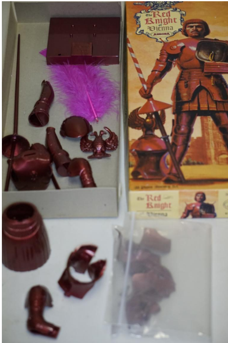
1/24 Monogram 1965 GTO

This model represents a Arnie "The Farmer" Beswick match race car. The chassis is from a Monogram Pro Stock Firebird kit that was lengthened to match the GTO's wheelbase. The bumpers were de-chromed and the rear wing was scratch built. Revell acrylic paint was custom mixed and applied over Tamiya white primer. The special decals are from Slix.