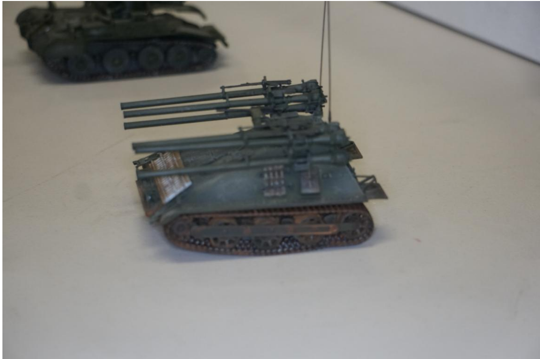
1/40 Revell 90mm Anti tank gun