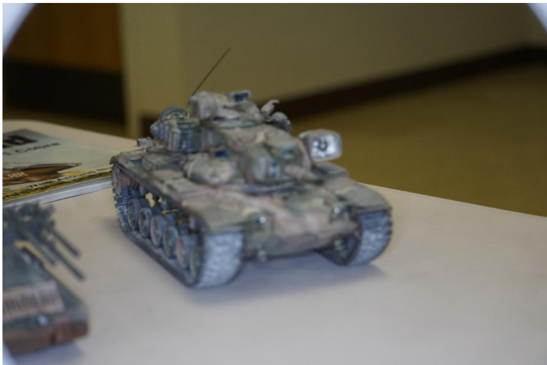
1/35 Academy M50 Entos

This was supposed to be a tank killer that could be air dropped into battle. It had an Aluminum body with 6 recoil-less rifles that could be removed and used on a tripod. The down side, it had to be loaded from the outside. The photo etch tracks on the front are added from Cliff's spares box.