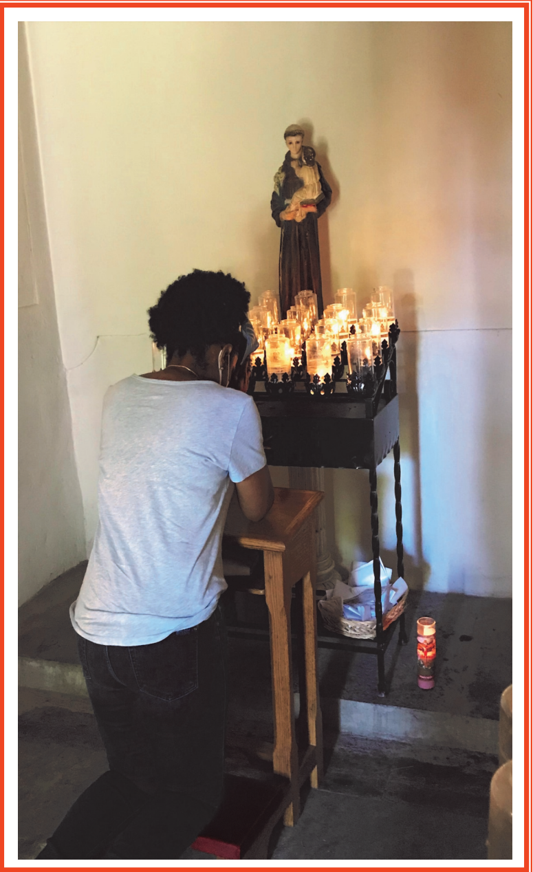
A Quiet Prayer at the Shrine