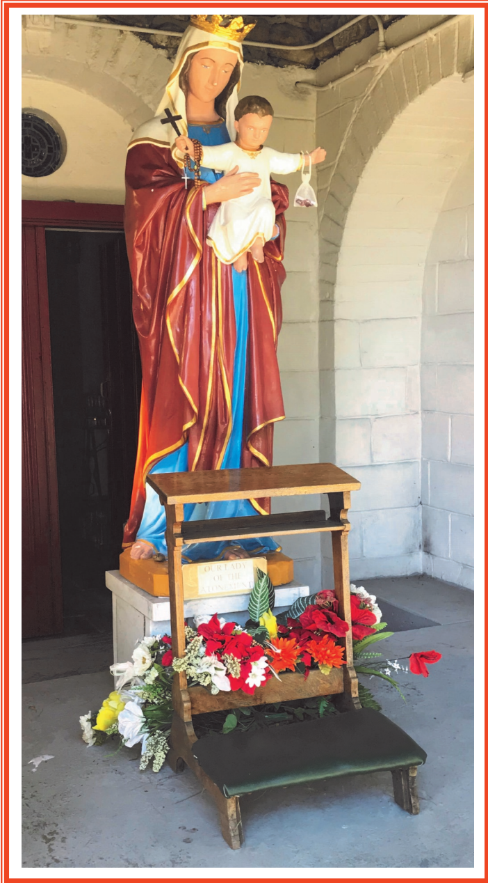
Our Lady of the Atonement Shrine