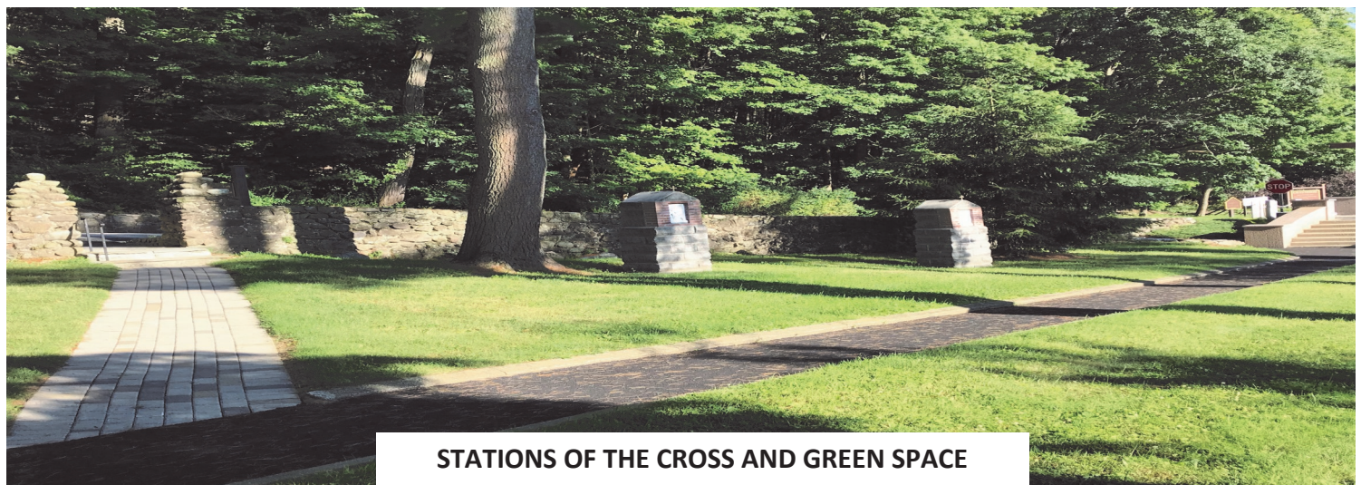
STATIONS OF THE CROSS AND GREEN SPACE