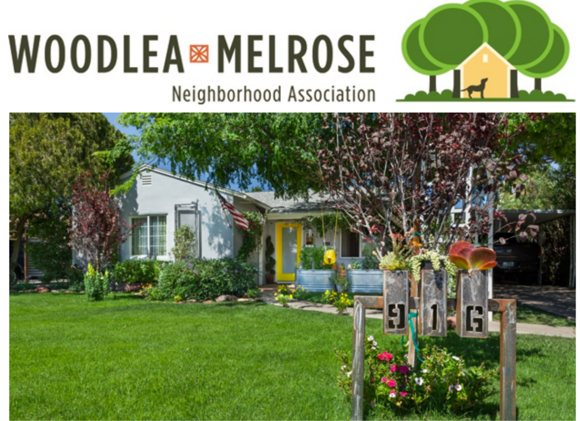
Live - Play - Grow - Flourish