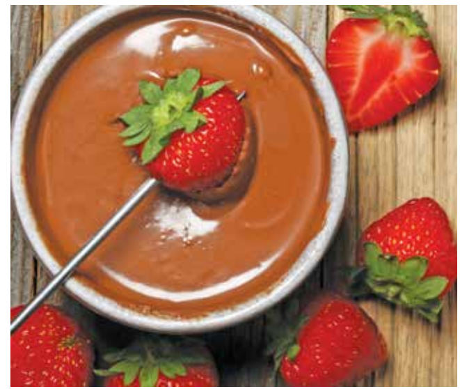
A fun and romantic dessert to share with the ones you love! Serve with fresh fruit, pound cake, cookies, or pretzels!

FONDUE: 1 1/3 c. heavy cream; 1 pinch salt; 12 oz. good quality chocolate chopped; 1 T. corn syrup