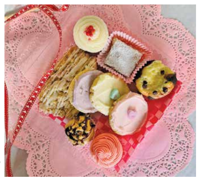
Valentine cookies - The Cookie Mill.