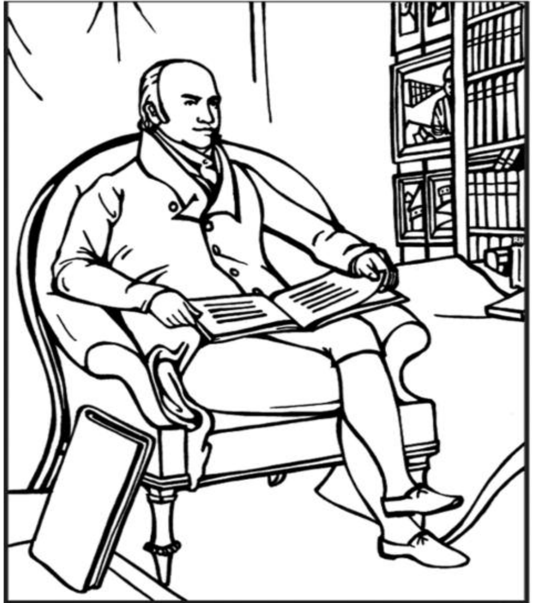
6. John Quincy Adams 1825-1829