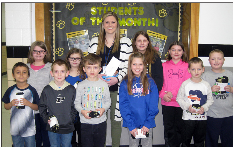
Loogootee Students/Staff of the Month