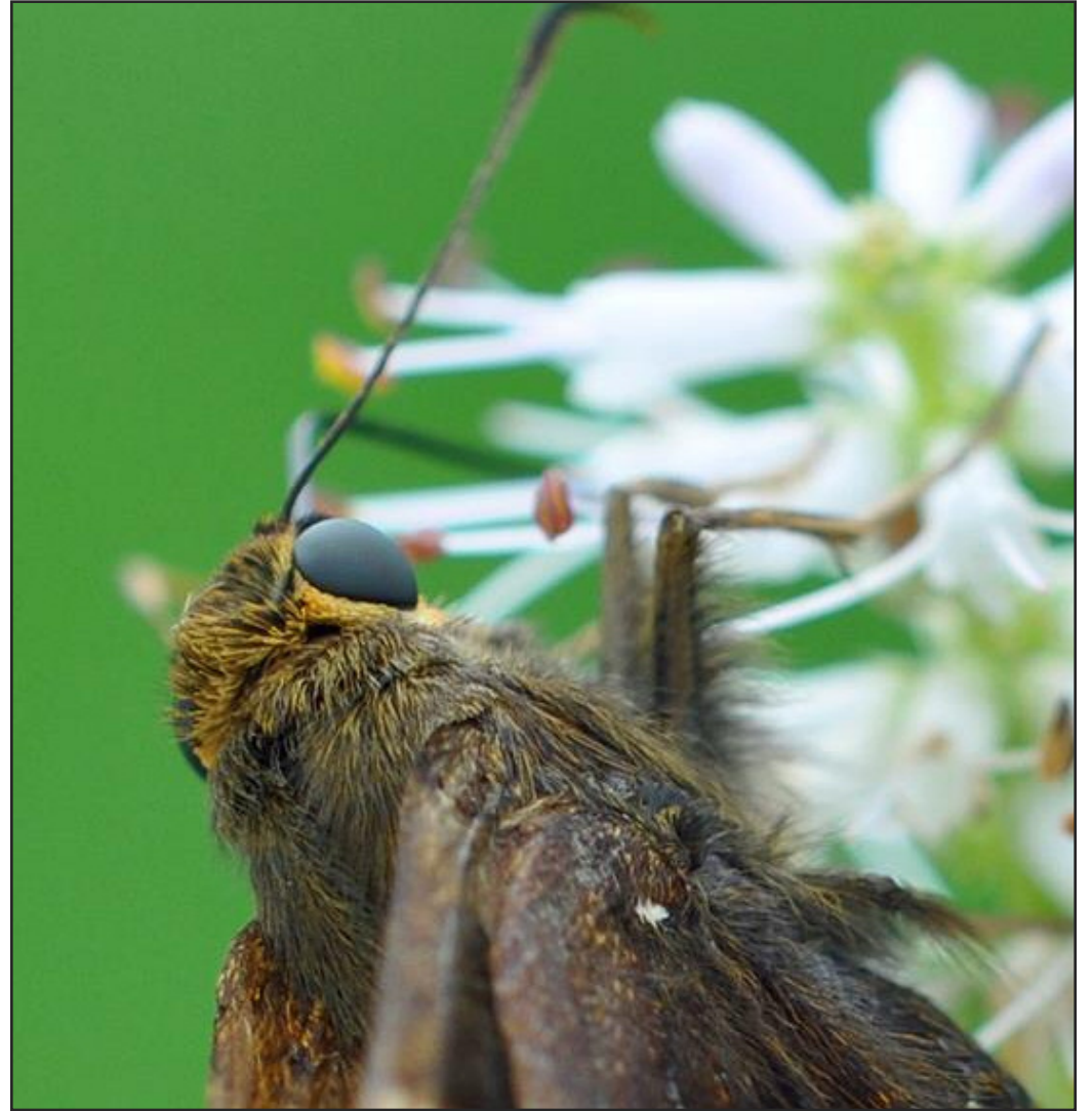
Extreme closeup

For more information on the workshops, or stored grain management, contact Ileleji at 765-494-1198 or ileleji@purdue.edu.