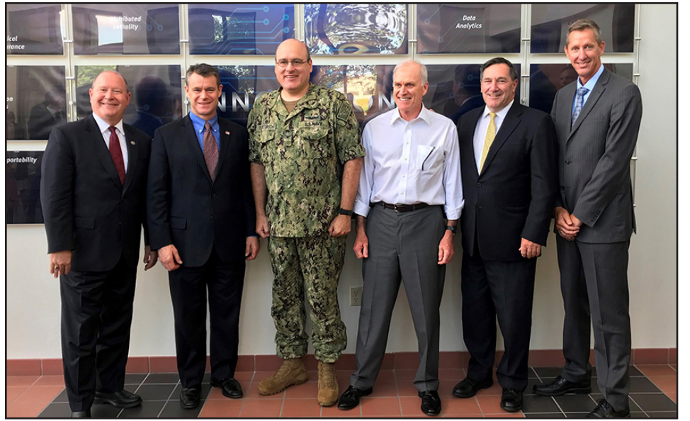
U.S. Senator Joe Donnelly (D-IN), U.S. Senator Todd Young (R-IN), and U.S. Representative Larry Bucshon (IN-08) hosted Secretary of the Navy Richard V. Spencer at Naval Surface Warfare Center Crane. Secretary Spencer visited Crane to see the installation first-hand and to hear directly from Hoosiers working there in support of our servicemembers and our nation's security.