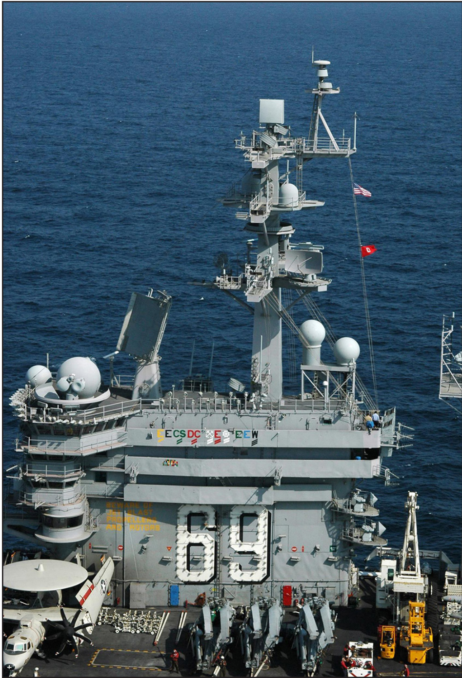
The "Buckeyes" flag from The Ohio State University is flown aboard the Nimitz-class aircraft carrier USS Dwight D. Eisenhower (CVN 69) as a show of support by IKE fans for the Bowl Championship Series (BCS) game against the "Gators" of the University of Florida. IKE and embarked Carrier Air Wing (CVW) 7 are on a regularly scheduled deployment currently operating in support of Maritime Security Operations.