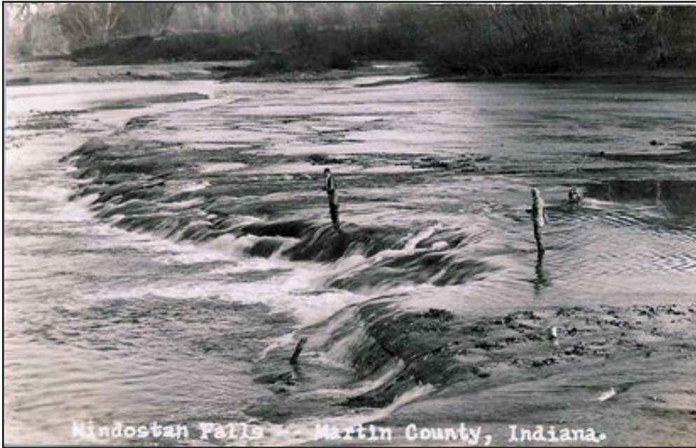
Hindostan Falls - Martin County, Indiana.