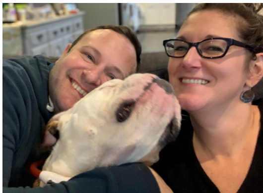
LEELA AKA RUTH BULLDOG GINSBERG