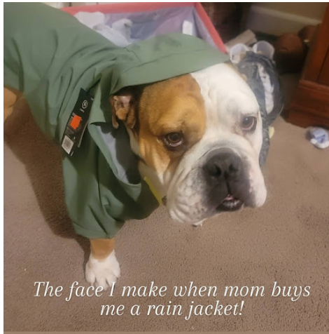
The face I make when mom buys me a rain jacket!

Pancake needed to be an only dog and the Guilmette family was looking for a younger male after they lost their dog. Pancake was ready even though he could do without the new wardrobe!