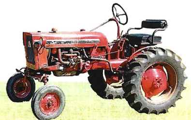
1979 Cub #253,682

32 YEARS AND 253,682 TRACTORS LATER, LAST KNOWN CUB...ALL IN THE SAME PLACE