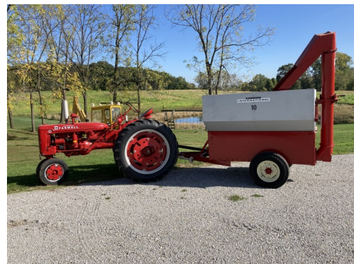
Right- His 1948 Farmall C & # 10 Grain Cart