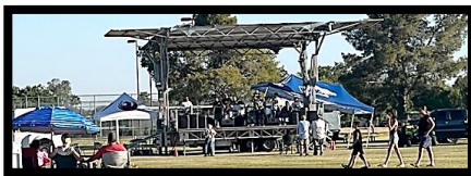
Main Stage with Power Drive for great entertainment