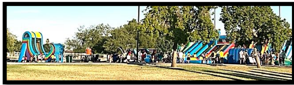
Water Inflatables and Slides