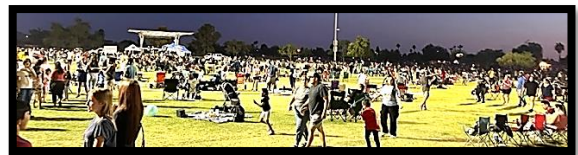
Thousands in attendance!