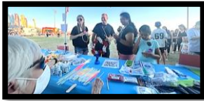
Bubbles, Glow Jewelry, Safety Items, Toys, and Candy!