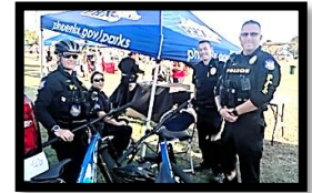
PD Bike Patrol