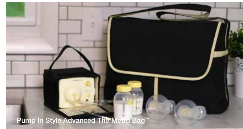
Pump In Style Advanced The Metro Bag™

The stylish microfiber bag features a built-in breast pump motor, an interior pocket to hold tubing between sessions, and enough room to comfortably hold your pumping must-haves and more.