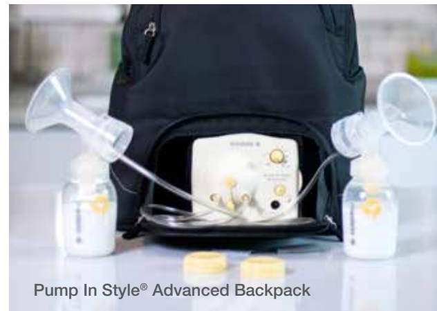
Pump In Style® Advanced Backpack

Visit MedelaAtWork.com for back-to-work solutions.