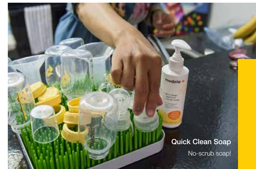
Quick Clean Soap No-scrub soap!