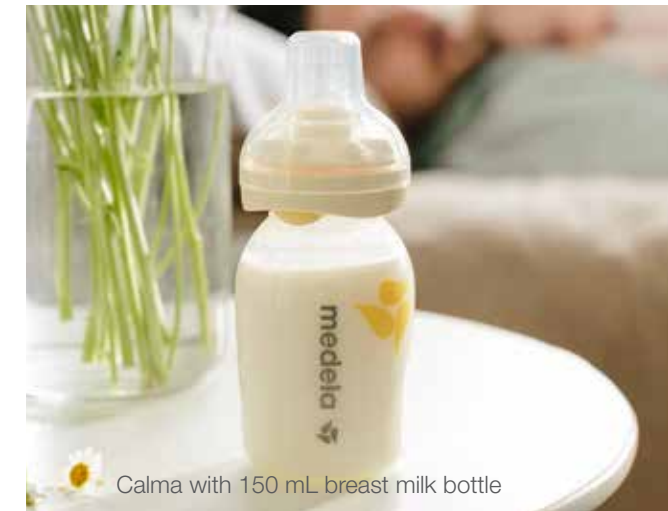
Calma with 150 mL breast milk bottle