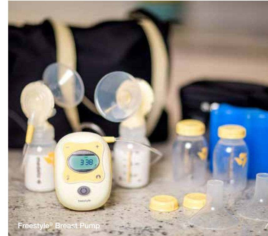
Freestyle® Breast Pump

All-in-one mobile and portable solution that includes Medela's breast pump carry bag, cooler set and 2 additional bottles, plus everything you need for on-the-go pumping.