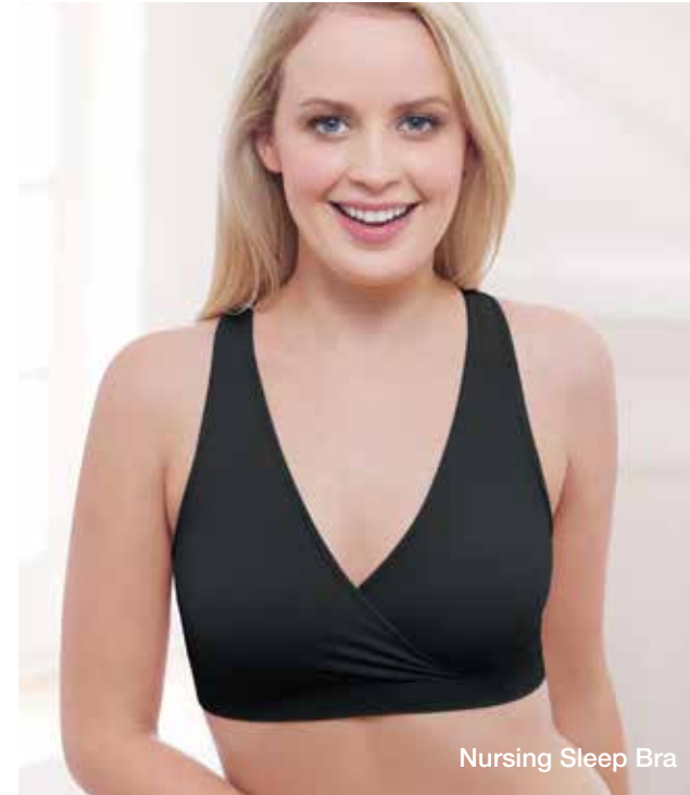
Nursing Sleep Bra