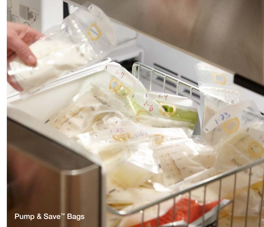
Pump & Save™ Bags