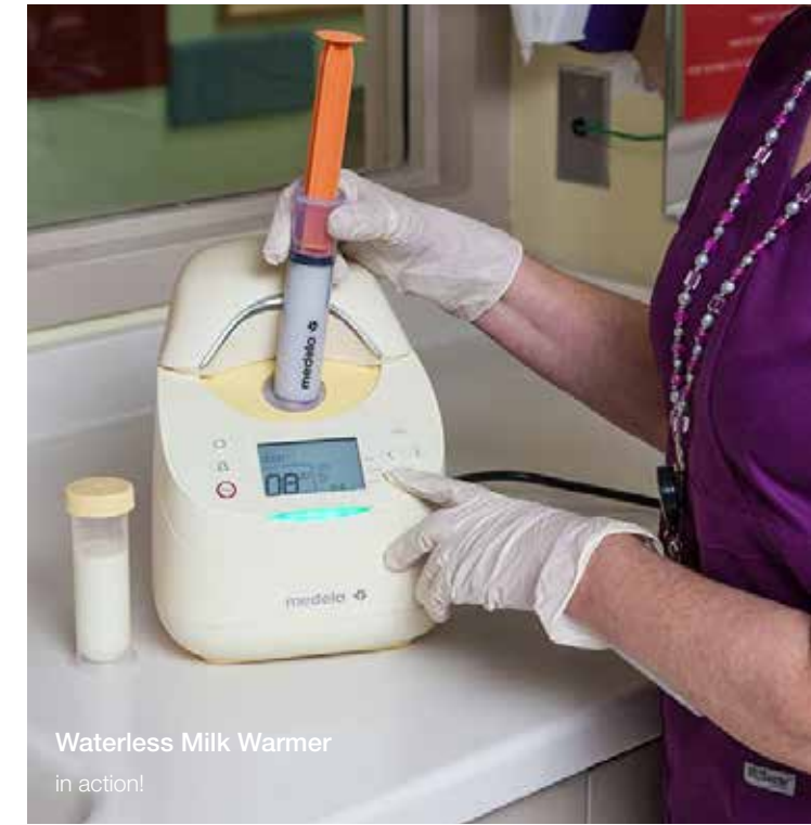
Waterless Milk Warmer in action!