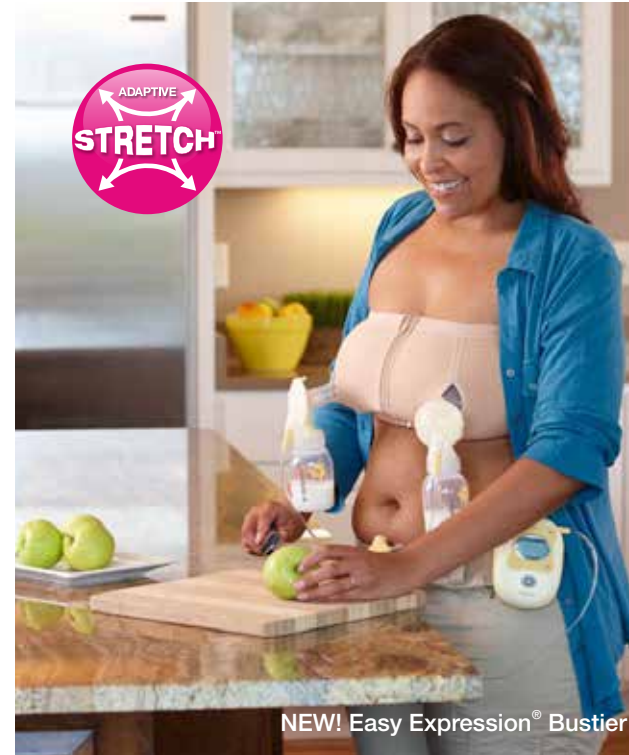
NEW! Easy Expression® Bustier

Redesigned with an integrated top hook, as well as reinforced openings for superior no-slip support. Featuring Adaptive Stretch™ technology to provide a confident fit and accommodate changing breast size through her entire breast milk feeding journey.