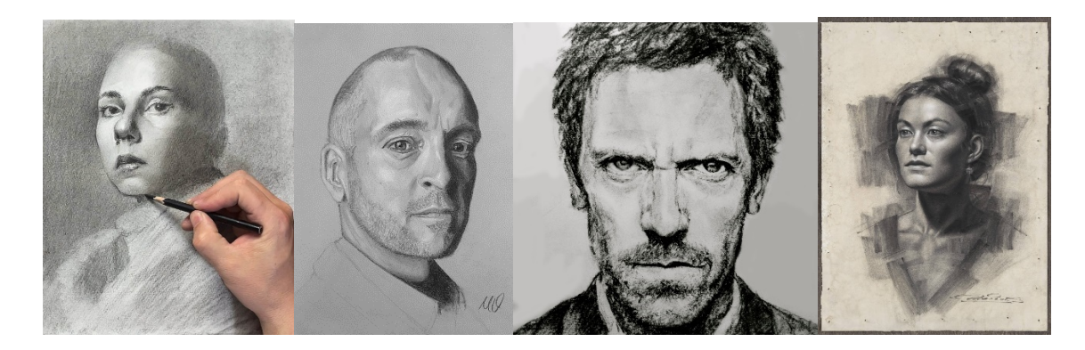
1:45PM, 2 Individually Competing Artists per team.