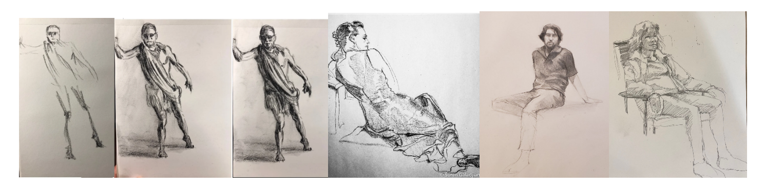
Figure Drawing Challenge

1:30PM, Up to 6 individually competing contestants per team. 2 contestants per heat. Individual students may compete in more than one heat .