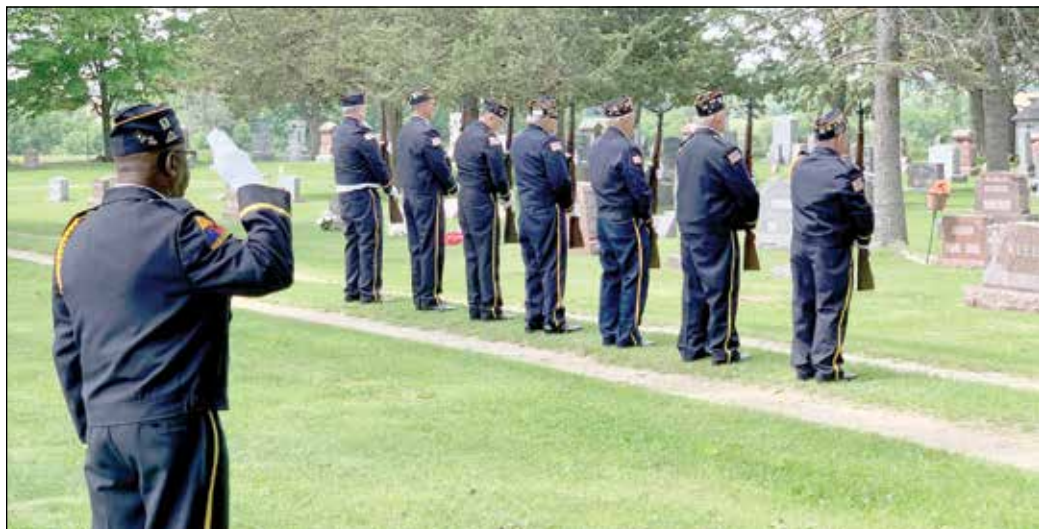
The American Legion Honor Squad from Abler-Engel Post 454 Mount Calvary paid respect to deceased veterans at St Paul's Church Cemetery on St Paul's Road on Memorial Day. The unit conducted services at 10 cemeteries located throughout the area east of Fond du Lac, known as the "Holyland".