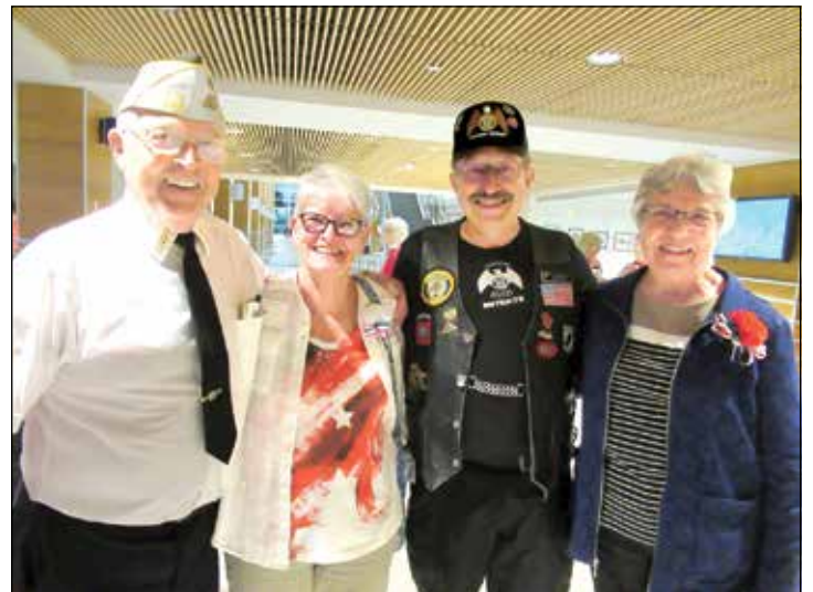
District 11 Legion Riders helped with the #40 Never Forgotten Honor Flight on June 6, 2022.