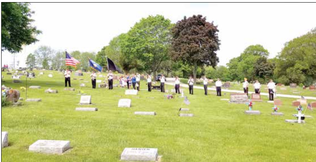
Pewaukee Post 71's Honor Guard giving Honor on Memorial Day in Pewaukee.