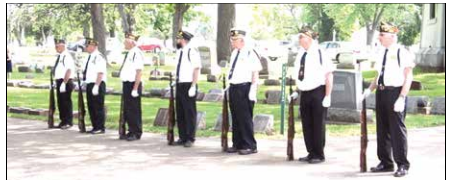
Neenah Legion Post 33's Memorial Day Ceremony at Oak Hill Cemetery.