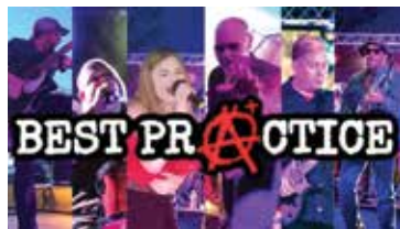
Saturday 1-4 PM