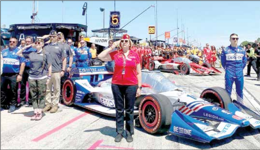
The sight from the starting grid at the SONSIO Grand Prix at Road America on June 12.