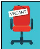
Vacant Membership Coordinator

Your IRA gives you the opportunity to lower your tax liability and begin creating a legacy for posterity.