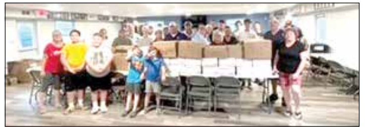
McFarland Post 534 sent 49 packages to troops overseas.