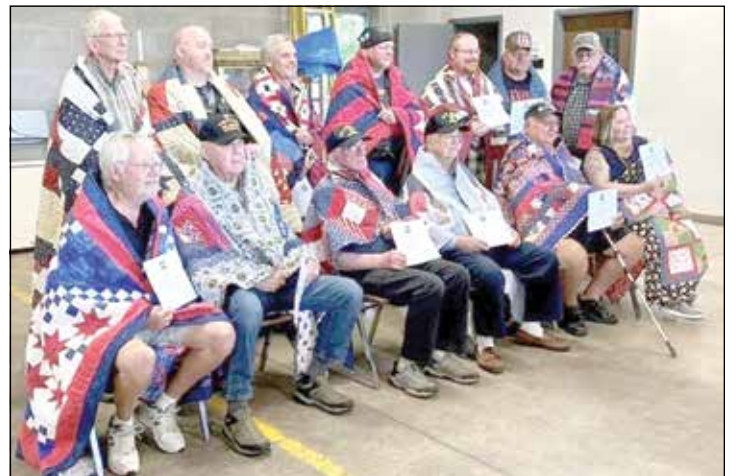
Haugen Unit 540 held their annual fundraising event during Haugen Fun Days, August 12 and 13. Raffle baskets, kolaches, root beer floats, cookies, and bingo were highlighted, as well as Unit 540 sponsoring the Quilts of Valor program with 13 recipients receiving quilts.