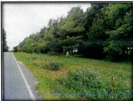
Proposed location of Option 1A along Route 7 Westbound