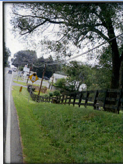
Proposed location of Option 1B along Route 7 Eastbound