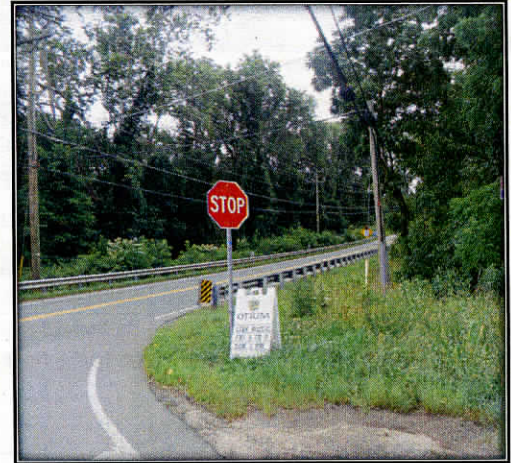
View of Tranquility Road and Route 7 intersection facing northeast

Please reference "Franklin Park to Purcellville Trail Alignment"