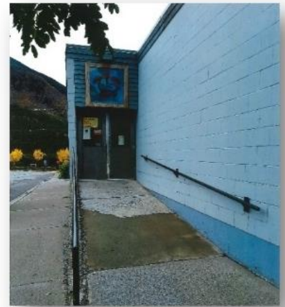
Lytton Restorative Justice Office 618 Main St.

We by no means are Lawyers nor can we act as one.