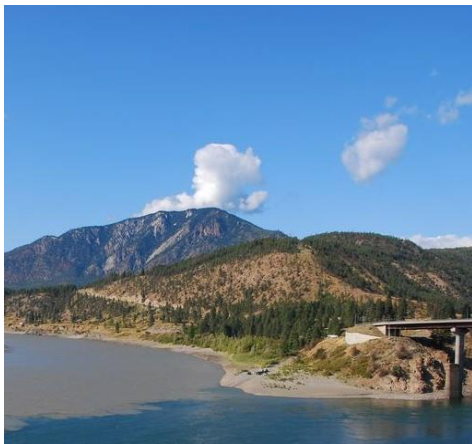
Kumsheen, where the rivers meet.