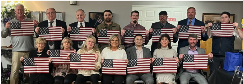
Congratulations New Elks!