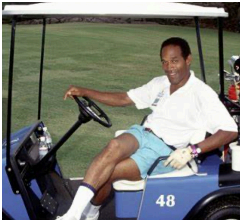
Enjoying a day on the Course