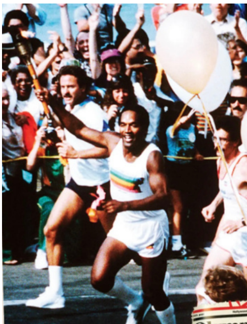
OJ carrying the Olympic Torch in 1984; Running in Santa Monica, Ca