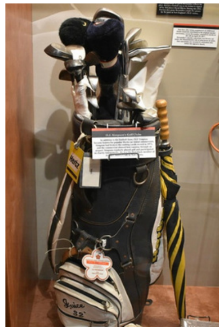
OJ's golf bag when he was sponsored by Hertz Rental cars