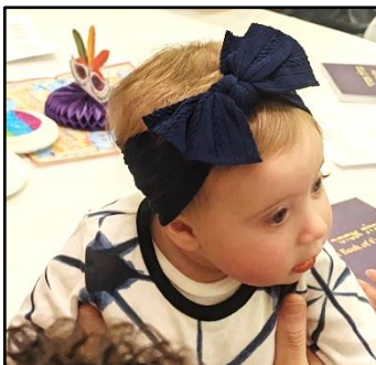
The smallest and the tallest!