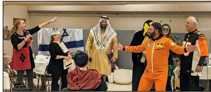
Let the drama begin!