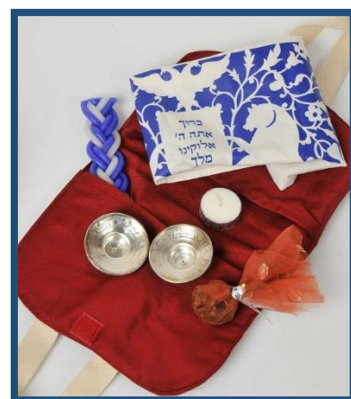
Mini Shabbat Away Set Shabbat candle holders Kiddush cup Mini birkon Mini B'Samim holder (with cloves) Havdalah candle Travel bag