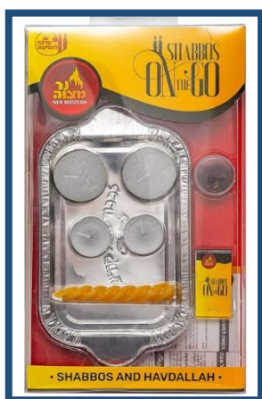
Shabbos On the Go Two travel lights Tray Matches B'Samim Beeswax Havdalah candle Card with blessings

Perfect for the business traveler, backpacker, college student, or bar/bat Mitzvah