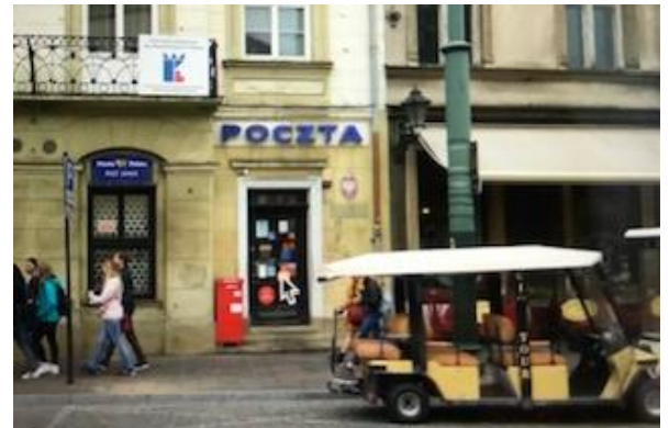
The post office