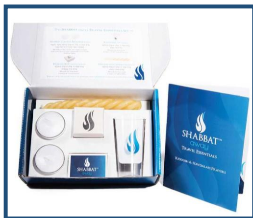
Shabbat Away Travel Essentials Shabbat candle holders (8 hours) Kiddush cup (100cc) B'Samim Box (with cloves) Havdalah candle (beeswax) Matches Card with blessings