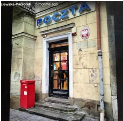
The post office

What interested Mom about the story, what she never got over, was the fact that they detailed four men to track her down. That zeal, that fervor, that attention to detail. "Imagine," she would say, "they sent four men in uniform to catch one eighteen-year-old girl."