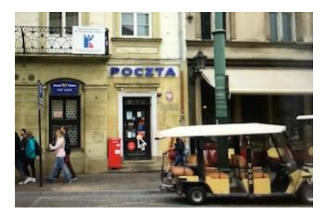
The post office