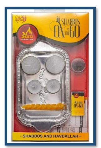
Shabbos On the Go Two travel lights Tray Matches B'Samim Beeswax Havdalah candle Card with blessings

Perfect for the business traveler, backpacker, college student, or bar/bat Mitzvah