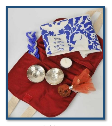
Mini Shabbat Away Set Shabbat candle holders Kiddush cup Mini birkon Mini B'Samim holder (with cloves) Havdalah candle Travel bag