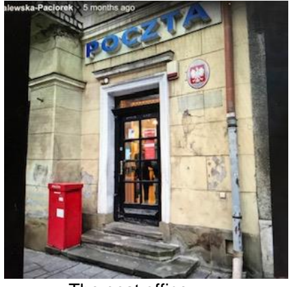
The post office

What interested Mom about the story, what she never got over, was the fact that they detailed four men to track her down. That zeal, that fervor, that attention to detail. "Imagine," she would say, "they sent four men in uniform to catch one eighteen-year-old girl."