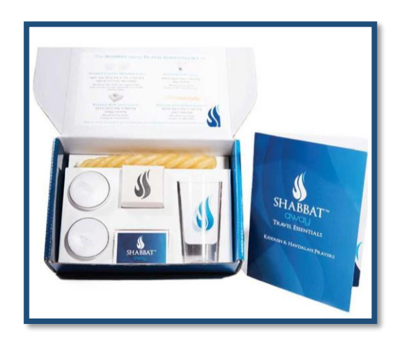
Shabbat Away Travel Essentials Shabbat candle holders (8 hours) Kiddush cup (100cc) B'Samim Box (with cloves) Havdalah candle (beeswax) Matches Card with blessings