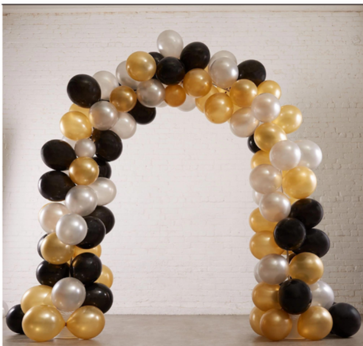
10 X 10 Balloon Arch

Price Includes Arch Rental up to 8 Hours