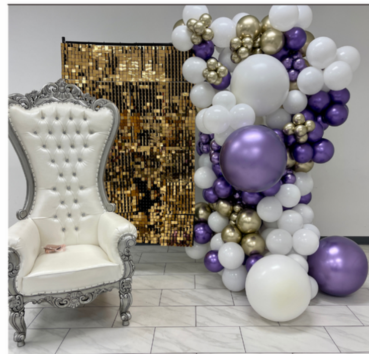
Balloon Garland with Backdrop