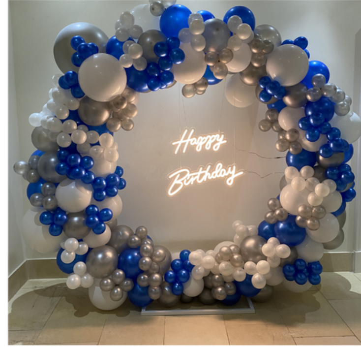
Full Round Frame