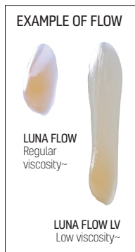
~At 40 seconds