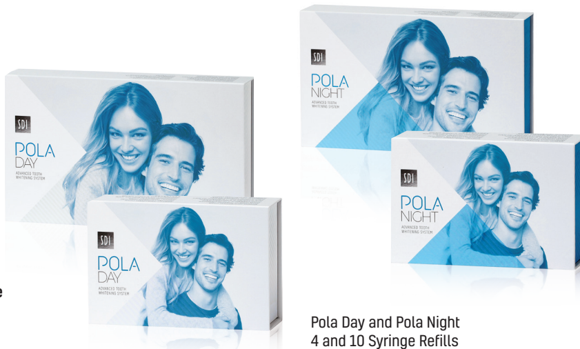
Pola Day and Pola Night 4 and 10 Syringe Refills