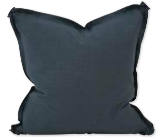
Linen Slub Indigo