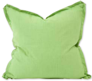
Linen Slub Grass