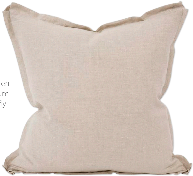
Linen Slub Natural

Simple linen pillows in bright colors by Robert Allen Fabrics®. The pillows feature flanged edges and butterfly corners.