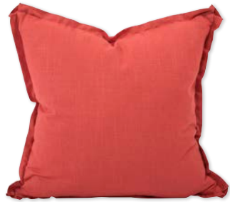
Linen Slub Poppy