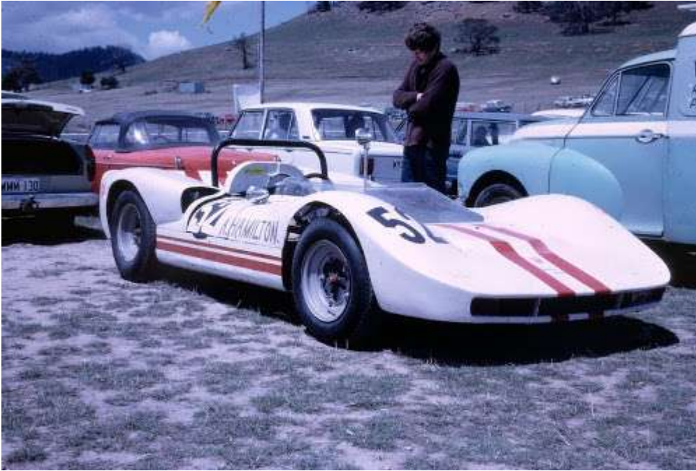
“The first of the Turnham cars”