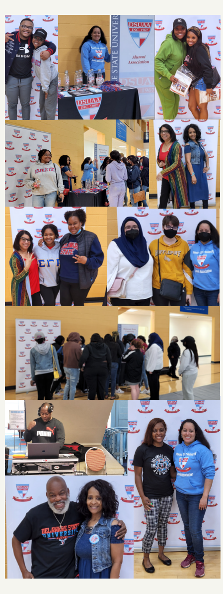
DSUAA engaged with the soon-to-be graduates at the Class of 2022 Senior Send-off on Friday, May 13th.