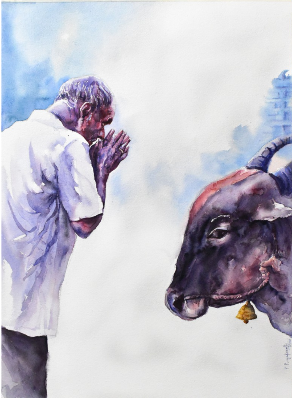
'Bhakthi' - Half imperial - Watercolor