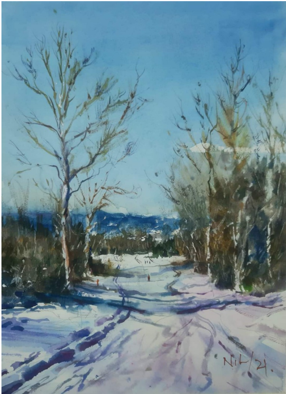
Winter beauty - Watercolour on paper