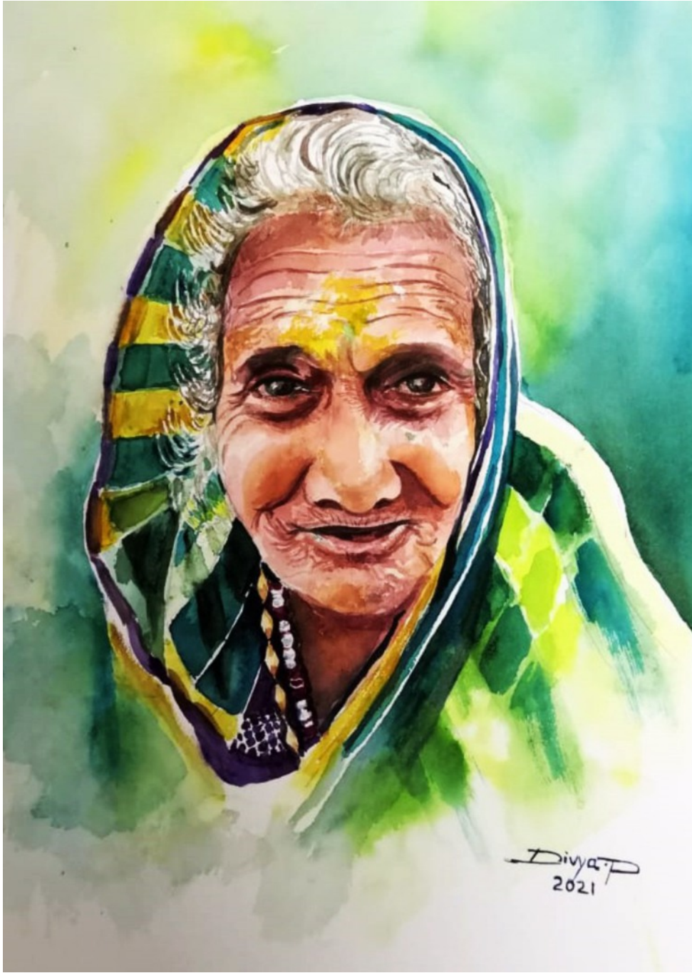
Wisdom of Old Age - Water Color - 13 x 9 Inches