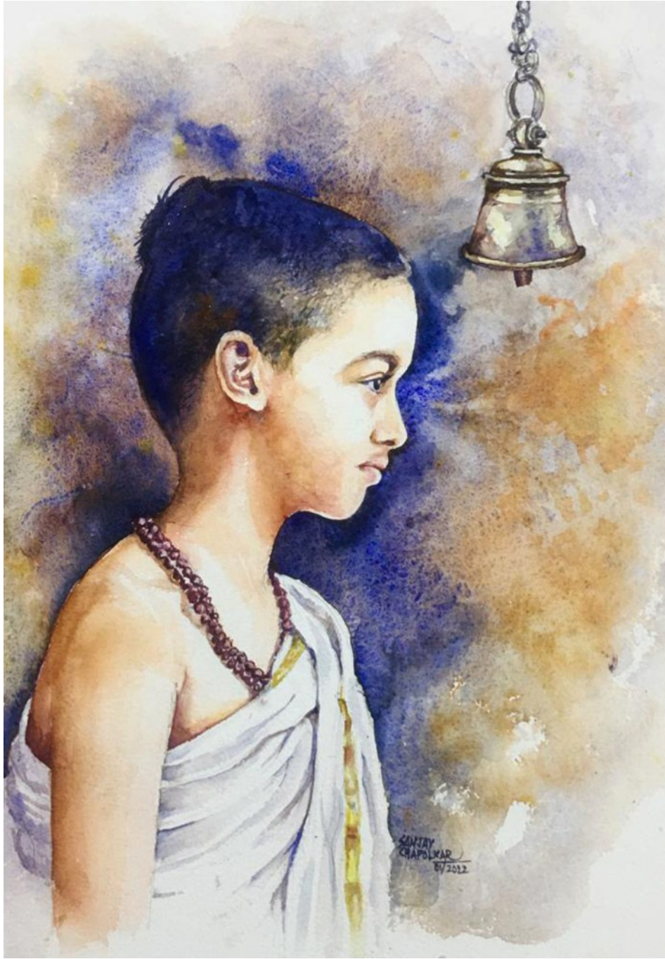
Young Disciple - Watercolor on paper - 18 X 13 Inches