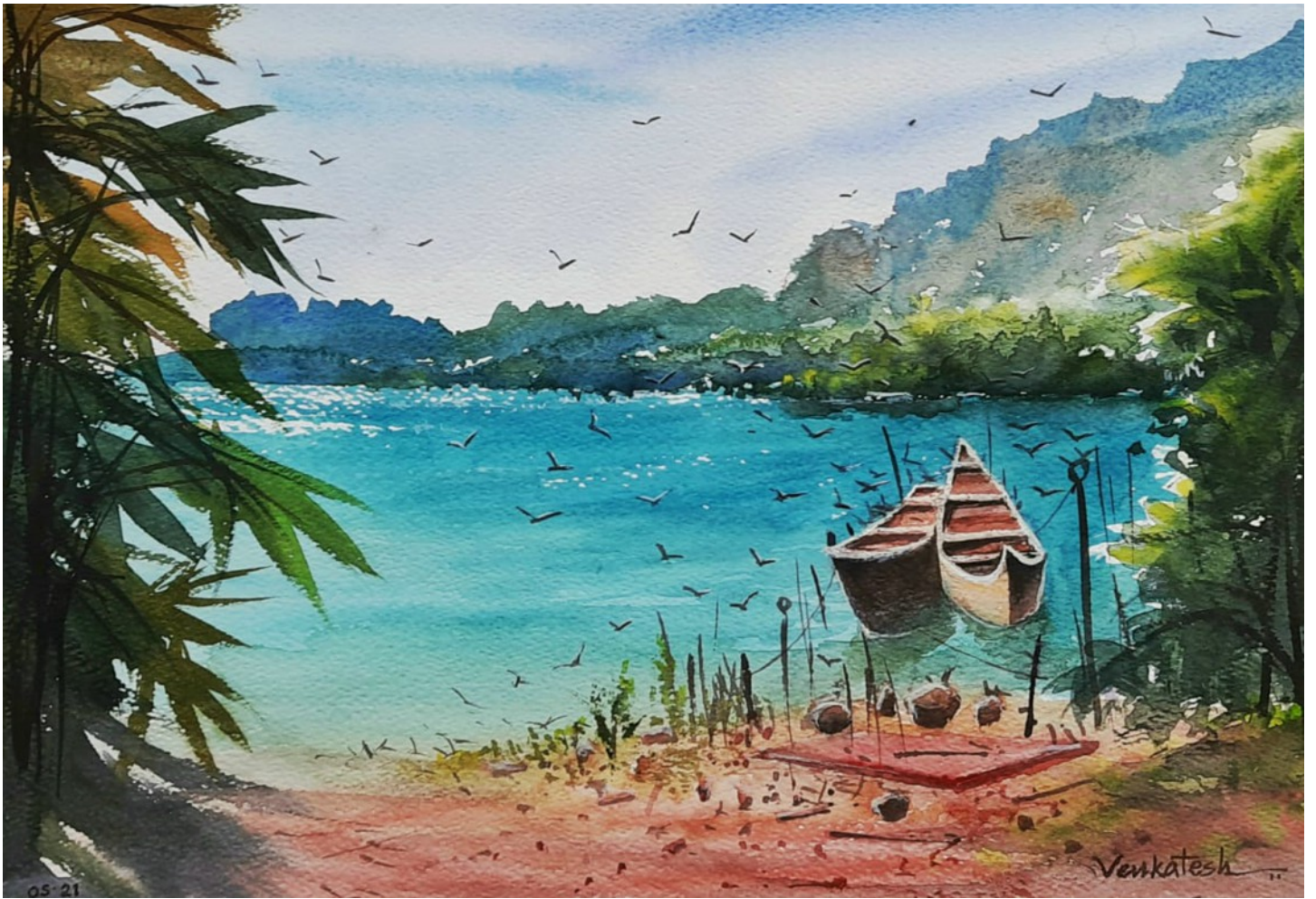
"Boats" - Watercolor on Paper - A3