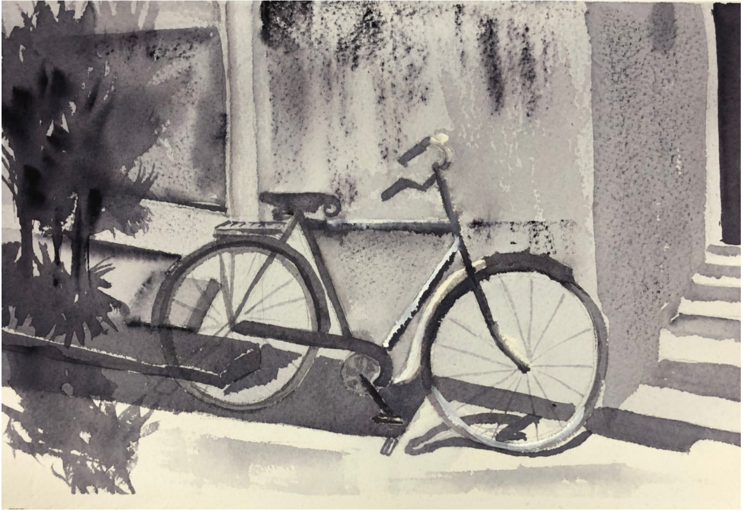
"An afternoon" - Watercolor on paper - 11 x 7 Inches