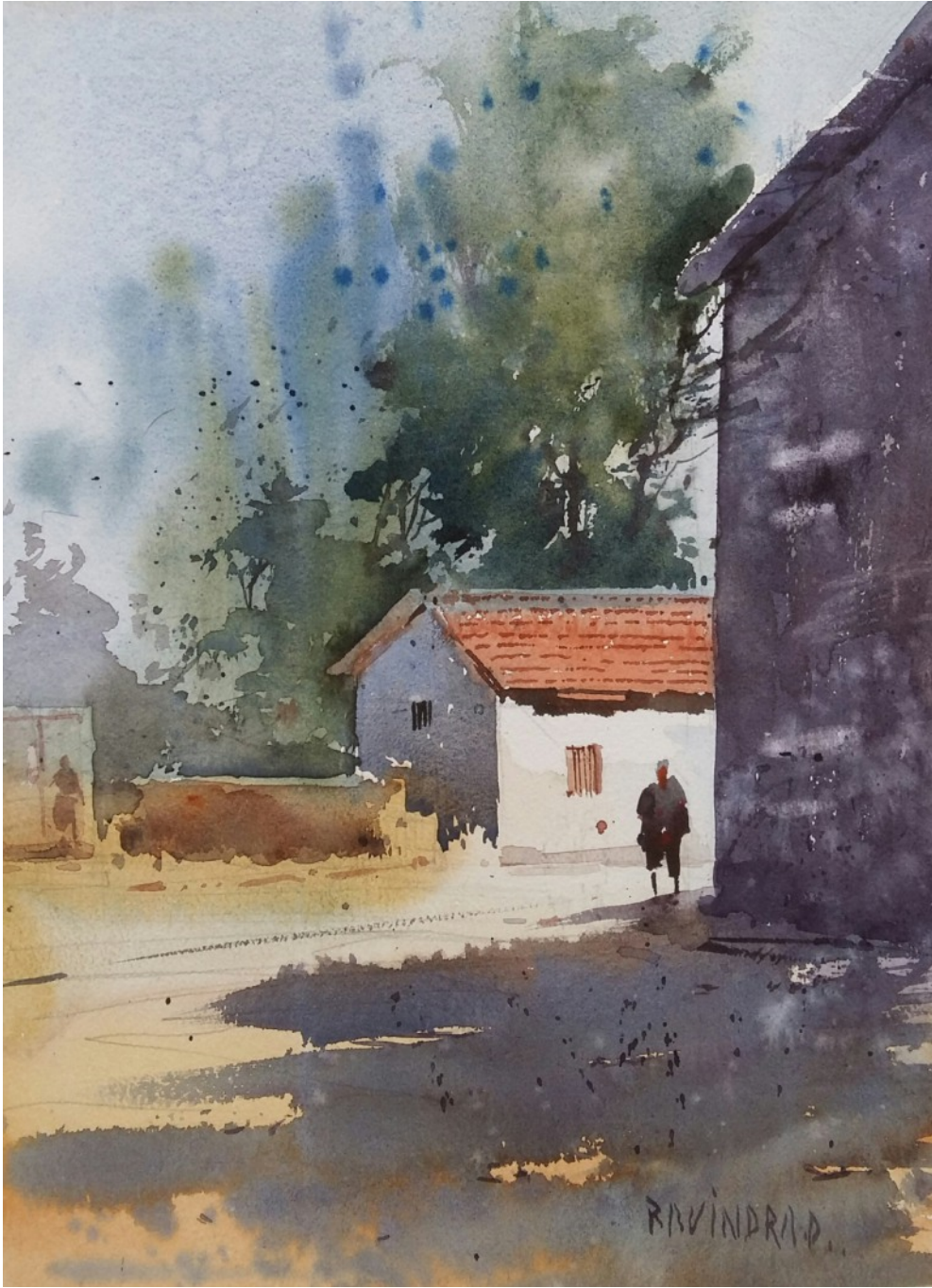
MORNING LIGHT - Watercolor on paper - 10 x 14 Inches