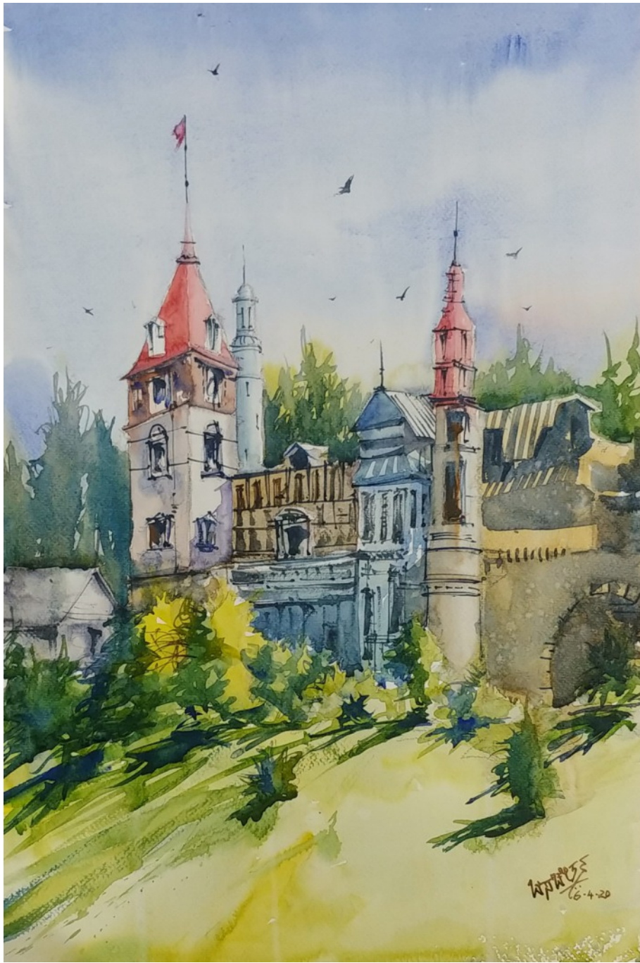
CASTLE - Watercolour on Paper - 15 x 22 Inches