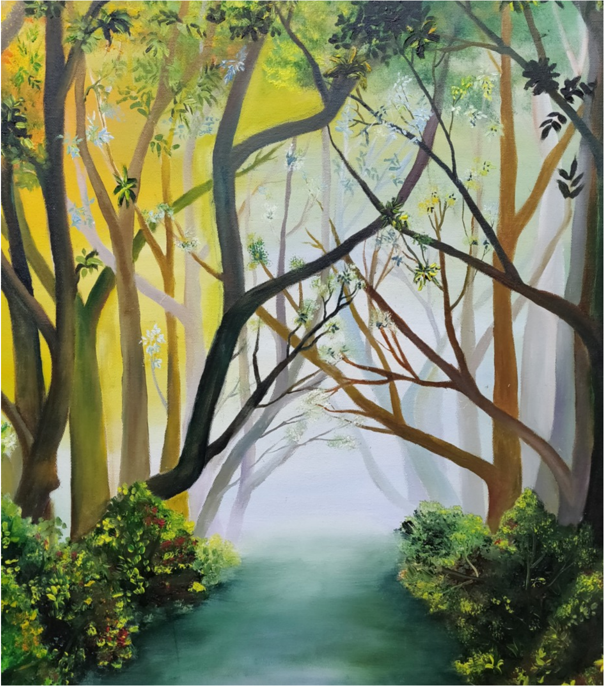
"WILD WOODS" NATURE SHOWS HOW TO LIVE, LOVE & GROW ALONGSIDE EACH OTHER Oil on canvas - 18 x 24 Inches