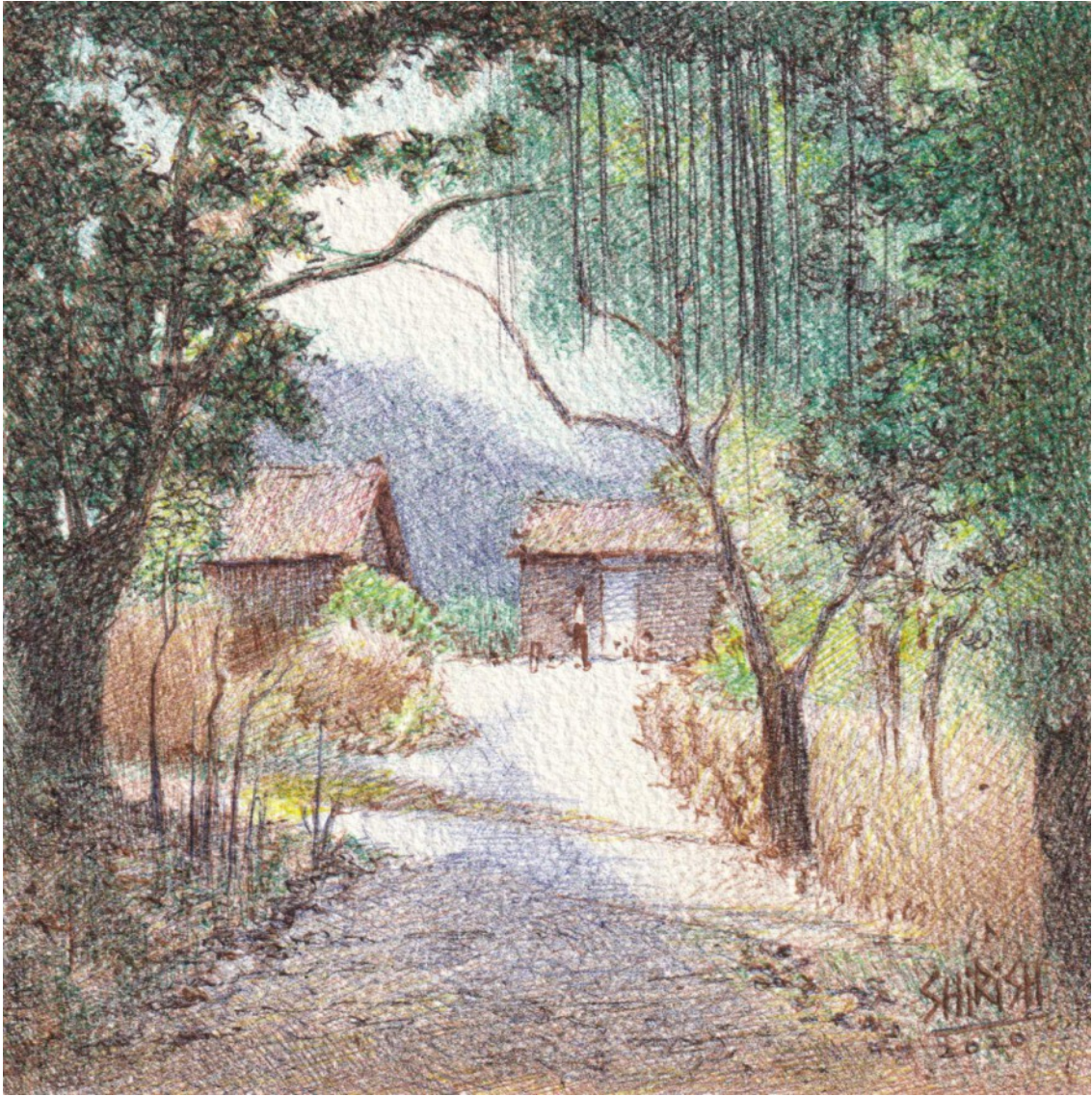
"Morning at Vaccine Depot" - 5 x 5 inches - Ballpoint Pens On Handmade Paper