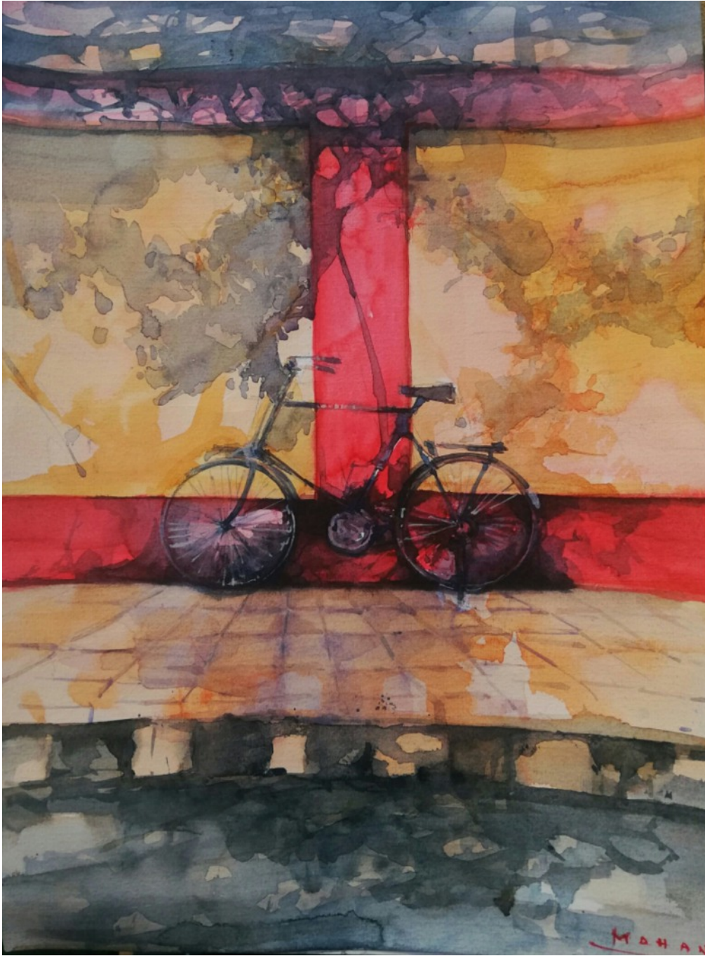
"Rest" - Watercolor on Handmade paper - 30 x 40 cm