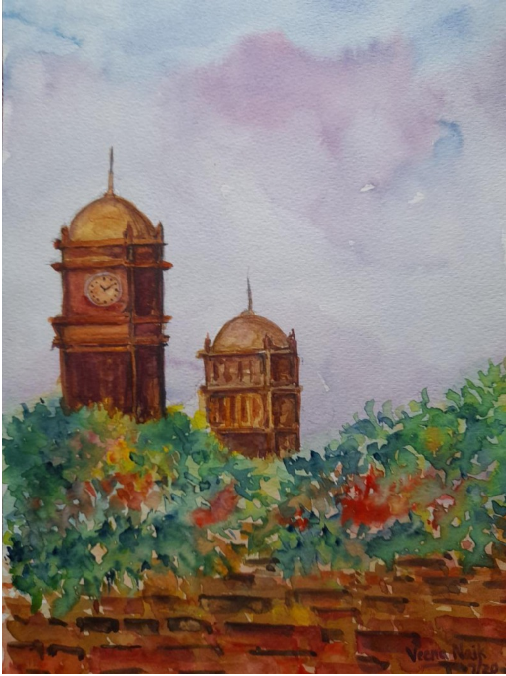
"View of Jamkhandi Palace" - Water colour on paper - 9 x 12 Inches