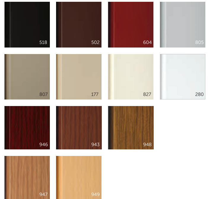
From Left to Right: Row 1: 518 Black [BLK], 502 Brown [B], 604 Wineberry [WBER], 805 Pewter [P805] Row 2: 807 Clay [C], 177 Sandy Beige [SB177], 827 Champagne [CAB], 280 White [W] Row 3: 946 Dark Mahogany [DM], 943 Karri [K], 948 Medium Teak [MT] Row 4: 947 Light Cherry [LC], 949 Rock Maple [RM]