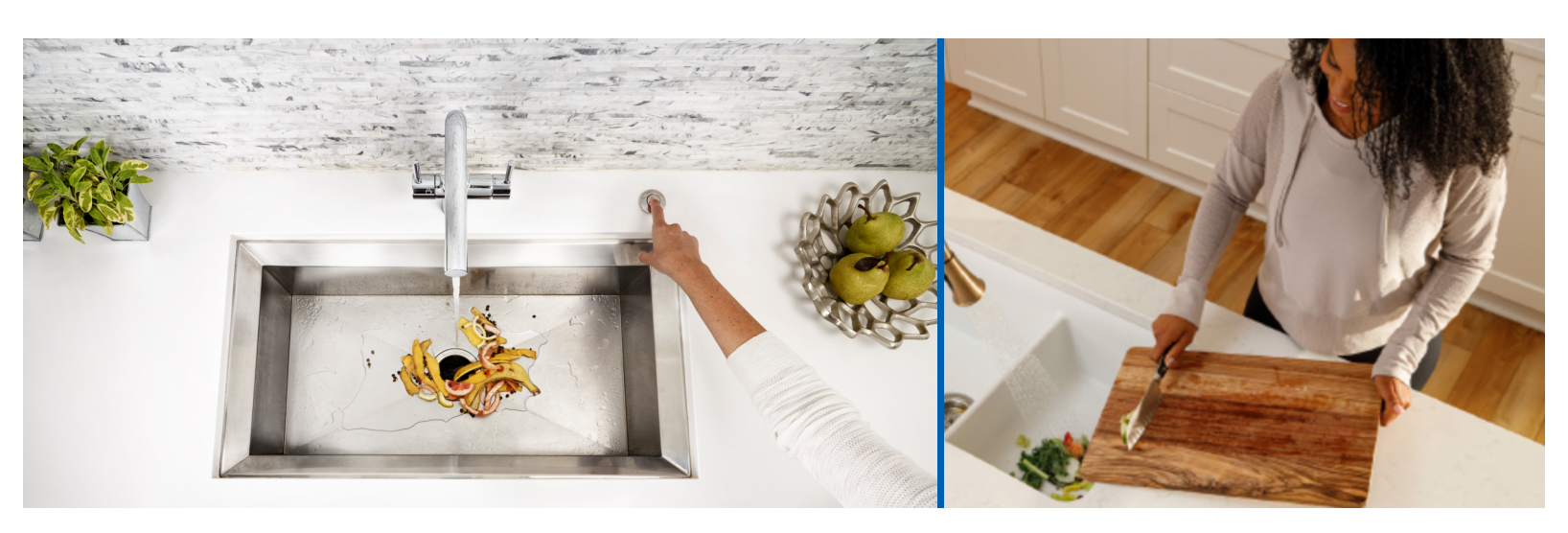
FOOD WASTE DISPOSER