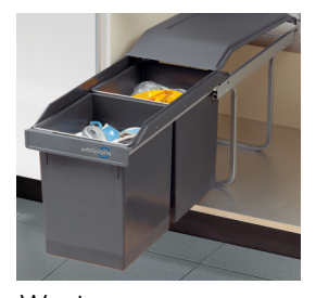
Wastezone Tandem bin HA3650101