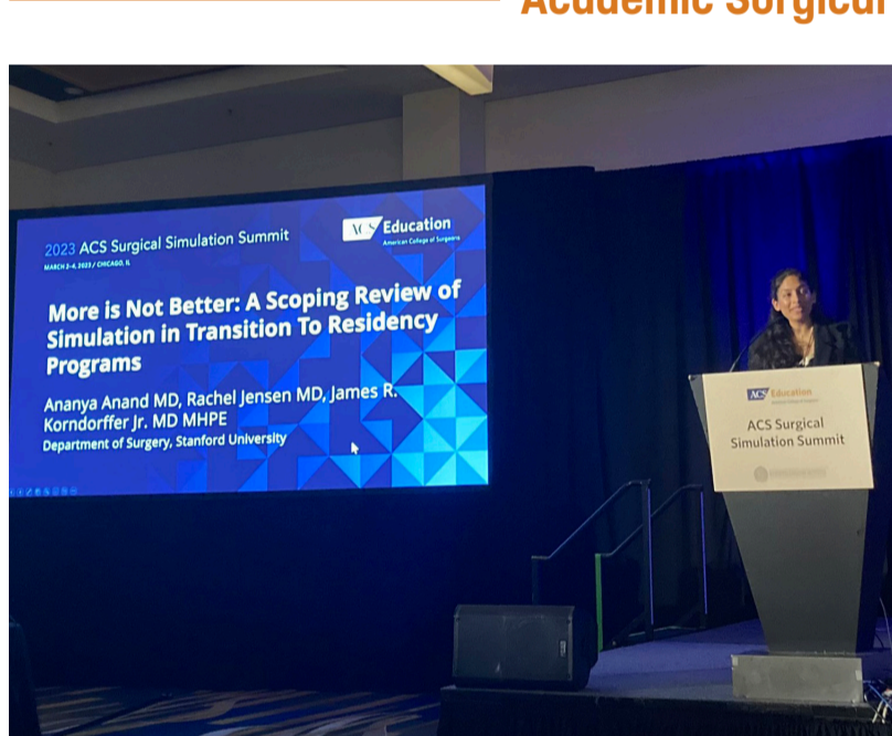
ACS Surgical Simulation Summit