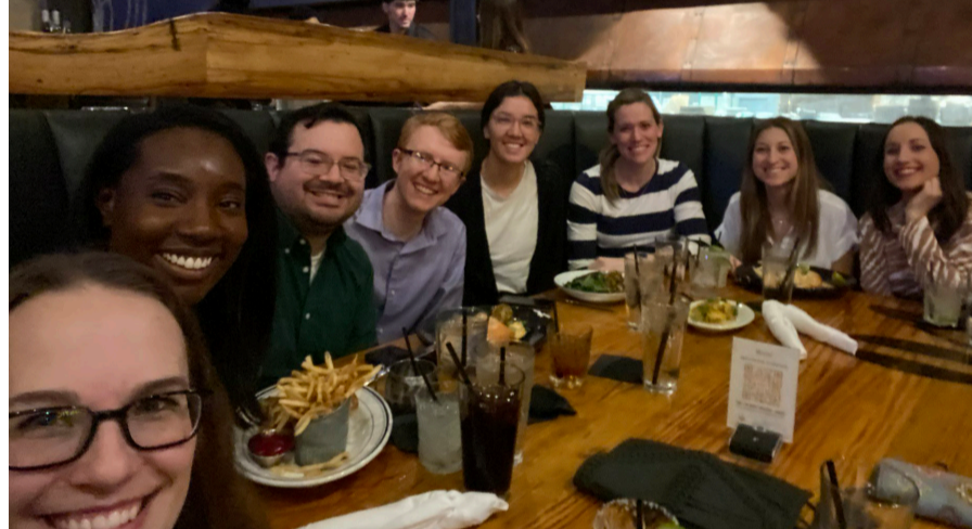
Academic Surgical Congress