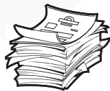
Cardboard and paper