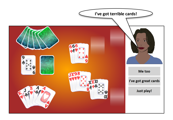
Figure 2. Embodied conversational agent in Always-On project.

The Always-On project is a four-year effort, currently in its fourth year, supported by the U.S. National Science Foundation at Worcester Polytechnic Institute and Northeastern University. The goal of the project is to create a relational agent that will provide social support to reduce the isolation of healthy, but isolated older adults. The agent is "always on," which is to say that it is continuously available and aware (using a camera and infrared motion sensor) when the user is in its presence and can initiate interaction with the user, rather than, for example