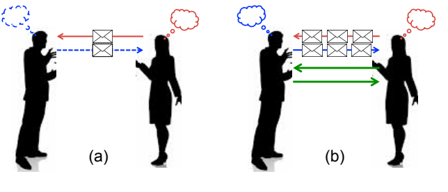
Figure 1. (a) Letter versus (b) continuous mutual signaling model.

*Current address: Toyota Technological Institute at Chicago, Chicago, USA. Email: bahador.nooraei@gmail.com