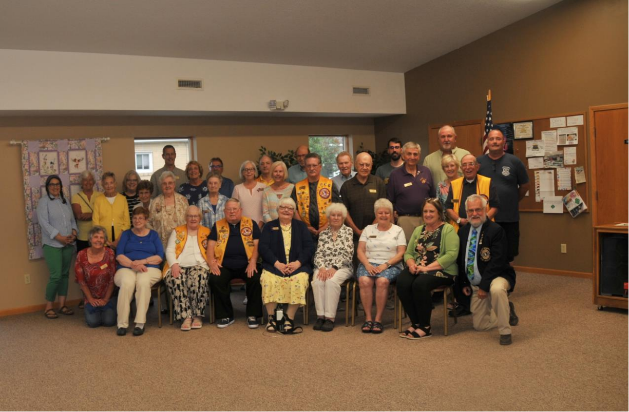
Oscoda Lions Club - "We Serve"