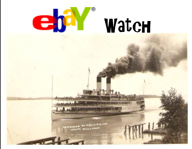
Tashmoo on St Clair River – a Pesha postcard. Recently sold for $36.07 on Aug. 12, 2010

Do you have a family story to tell? Any skeletons to rattle? Do you have a passion for the Island you want to share? Maybe some old time photos? Email us at <a href="mail@hiscfhs.org"><u>Email@hiscfhs.org</u></a>