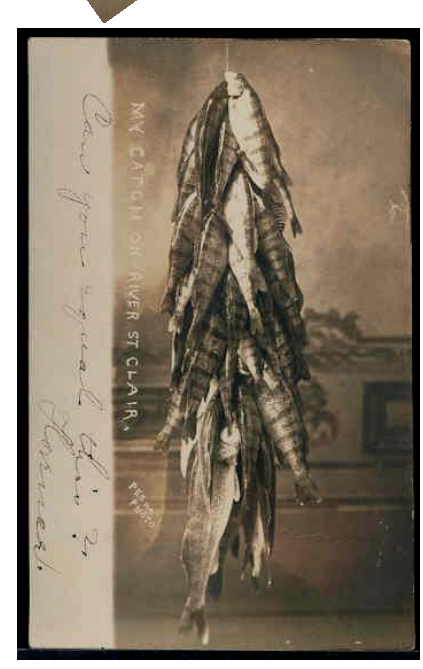
Pesha Photo – "My Catch on River St Clair" listed in an ebay store for $29.99.