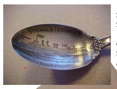
Spoon with Steamer Tashmoo. "Jane" is engraved on the handle. Sold for $52.77 on Aug. 19, 2010