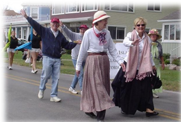
Lions Club Turkey Shoot Parade Labor Day Weekend