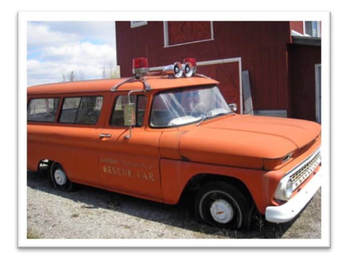
1963 Chevrolet Suburban BODY STYLE – STA-WAGON WEIGHT – 3990

The battery currently in it is 9" \times 6.5" It is a DEKA part no. 775DT CA @ 32 degrees F. = 860 CA @ 0 degrees F. = 720 The tray it sits in is about 10.5" \times 6.5"