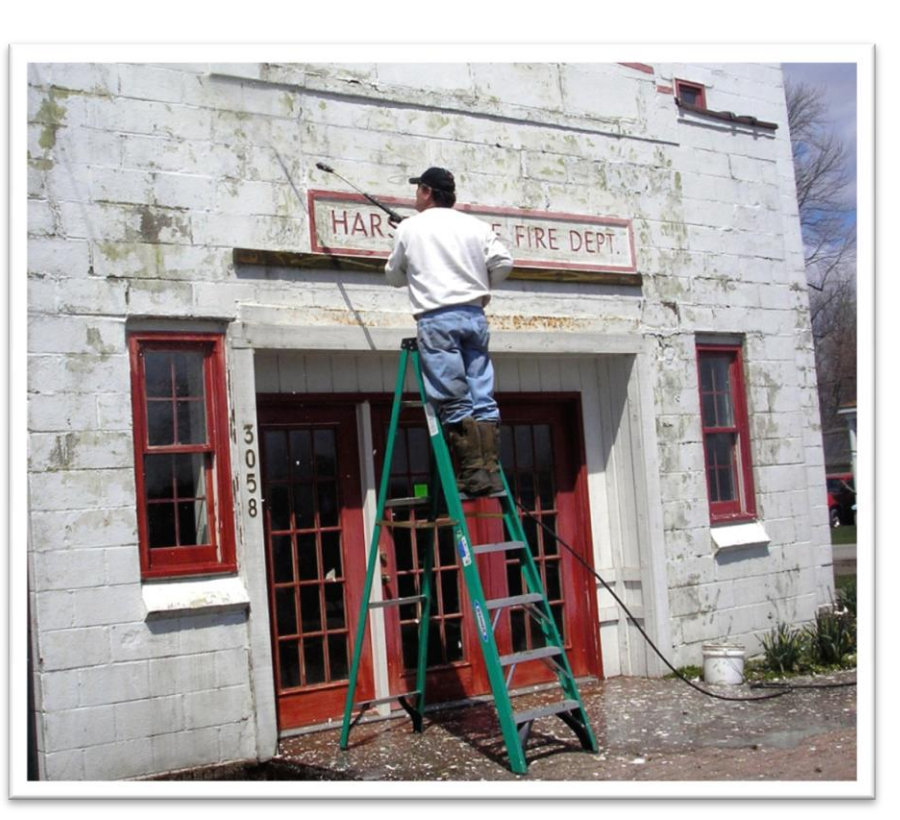
Powerwashing the exterior.