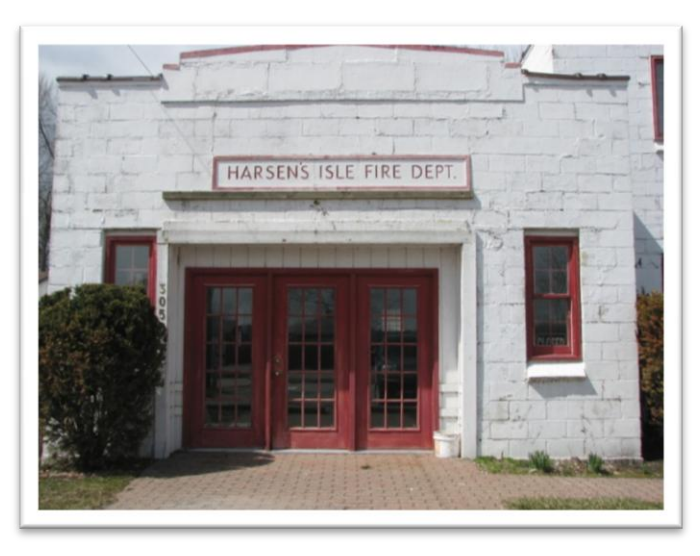
Our future home.