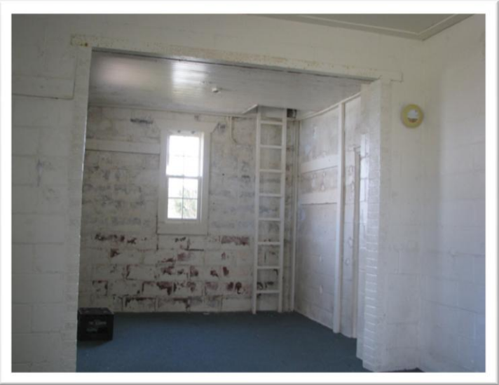
Interior shots after the walls were scrapped.