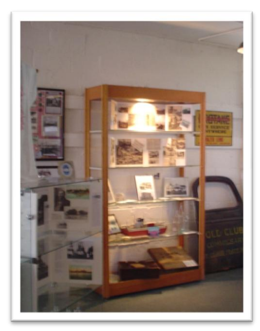
Part of our ferry display.