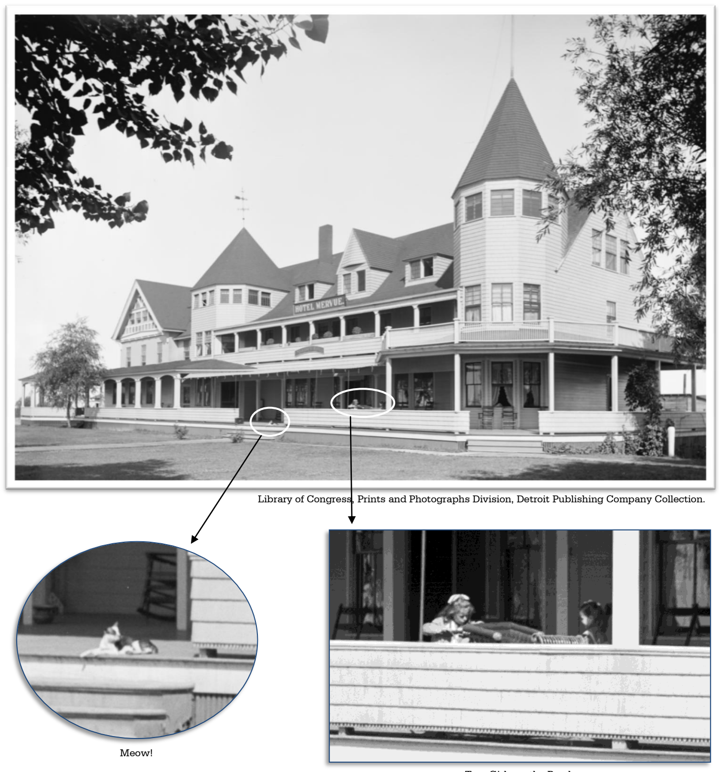
Two Girls on the Porch.