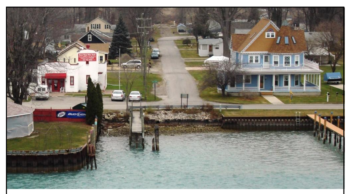
A 3-phased plan would eventually join the Old Fire Hall on the left and the LaCroix house on the right. Williams Street would dead end at the back property line. The adjoined properties would be developed with park benches, grills, shuffleboard and horseshoe pits for everyone to enjoy.

Phase III requires the closing of Williams Street at the back property line. Some discussion has taken place with the