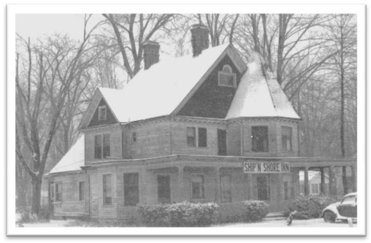
Ship'N Shore Inn

In addition to a well assorted stock of goods, coffee and lunches were served from 7am to 6pm. By 1905, his prosperity was obvious when he completed his new home. The home was luxurious by standards of the day: large, elegantly paneled, appointed with marble counter tops and equipped with hot and cold indoor plumbing. Today the home has been beautifully restored but many of us remember it as the Ship'N Shore Inn. This enterprise tried to take off in the 1950s but failed and the building sat in neglect for many years.