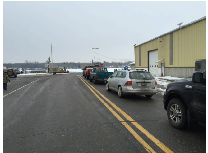
Islanders lined up to park a car on the Mainland or depart.