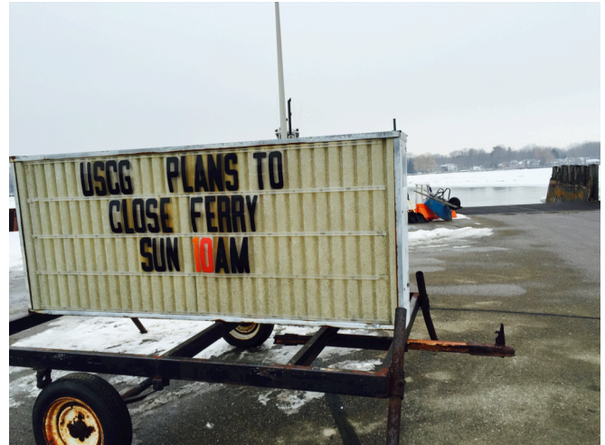
Ferry Closure Notice