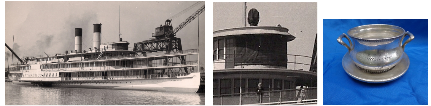
Additional photos of the Tashmoo Steamer and the Artifact.

If you are interested in supporting this effort, please contact a Board Member at your earliest convenience. Phone numbers of all Board Members are available on page 2. It would be 'another Society achievement' to have this Tashmoo Artifact on exhibit on Opening Day Saturday, May 28<sup>th</sup>.