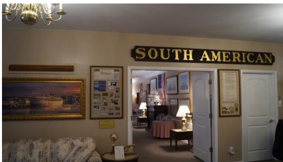
The stunning layout of this unusual museum heightens both the aesthetic and the educational value to the visitor.