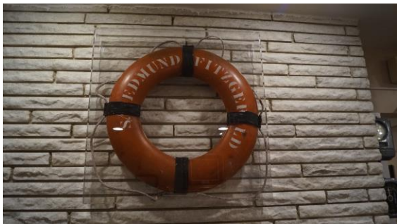
An original Life Ring from the Edmund Fitzgerald retrieved the day after the tragedy.