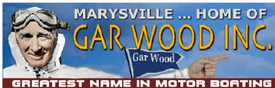
One of many billboards erected in Marysville in the early 1930's.

Lecture at the Algonac/Clay Maritime Museum