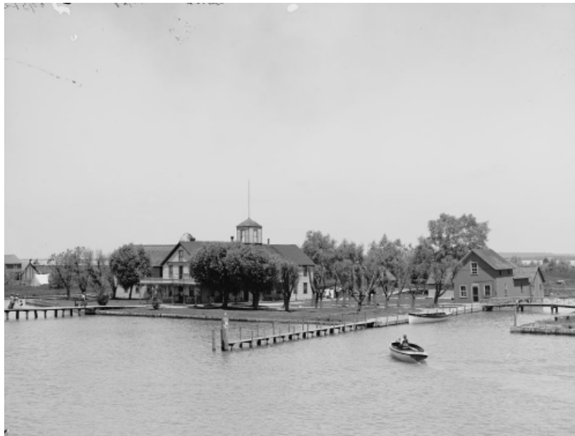
Bedore Hotel St. Clair Flats