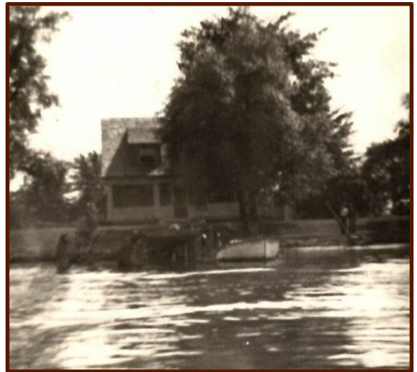
Besemer cottage in the 1940's